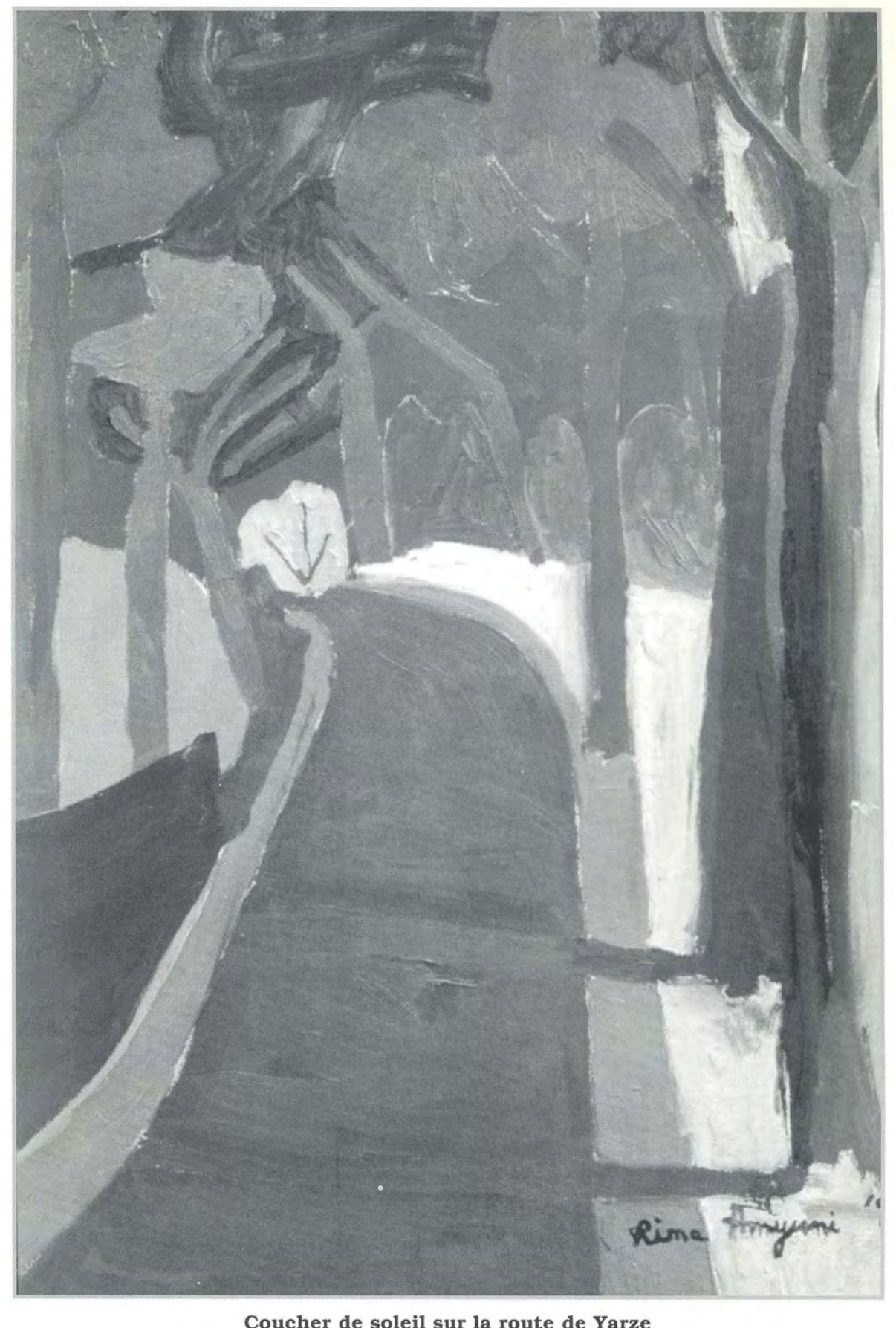
Coucher de soleil sur la route de Yarze Rima Amyuni, 1995, huile sur toile, 178 cm x 121 cm.