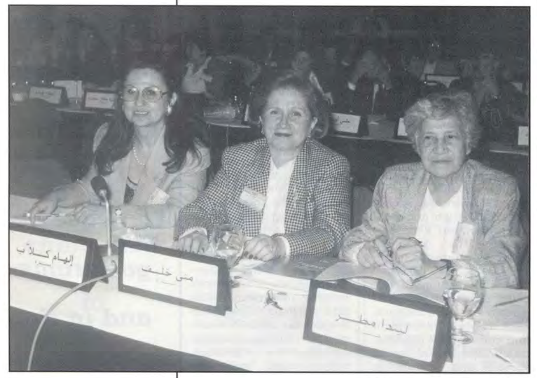
Lebanese women experts invited to attend the Regional Preparatory Meeting.

emphasizes the elimination of the remaining obstacles to the integration of women in the sustainable development process.